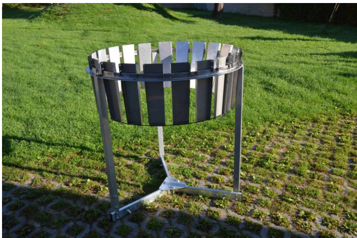
Overview of the shield with base, vertical rods and lamellae.