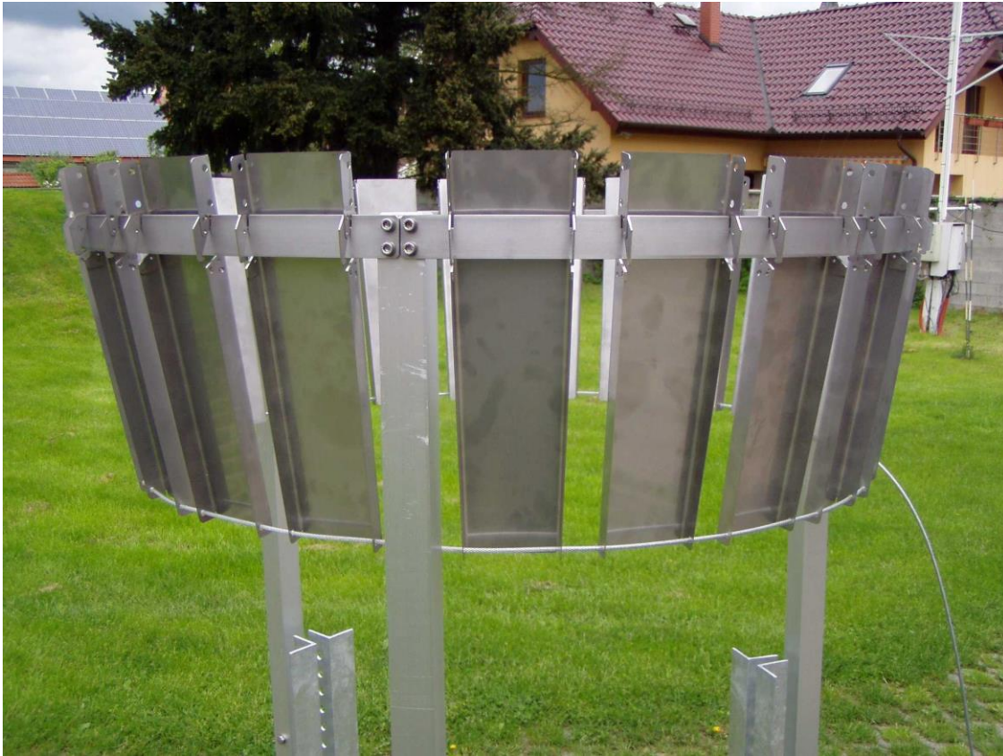
Lamellae which creates shield are closely movable